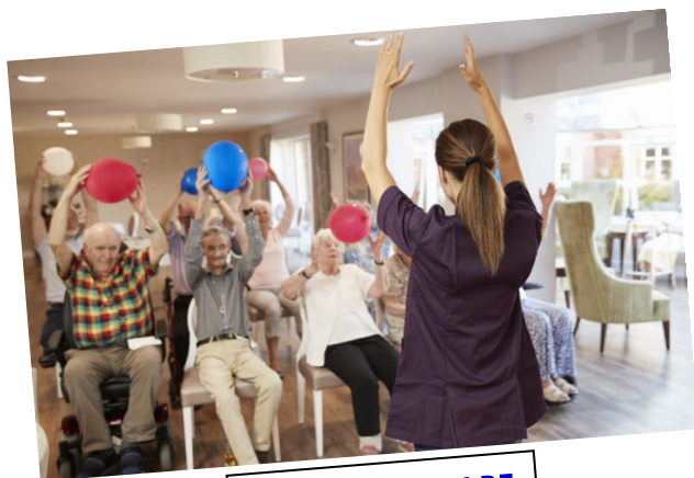
ADULT DAY CARE