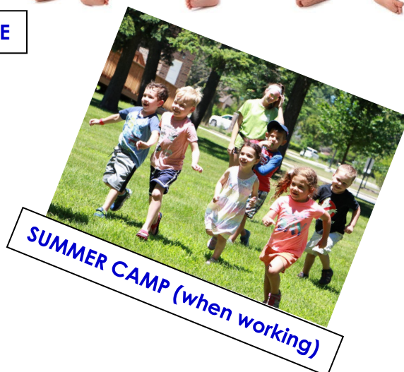
SUMMER CAMP (when working)