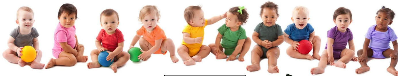
CHILD DAY CARE